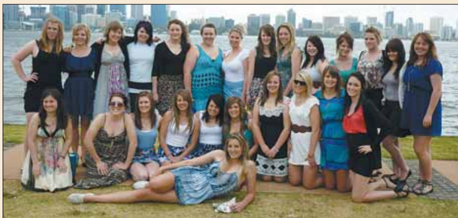
Boarders' Breakfast 2009